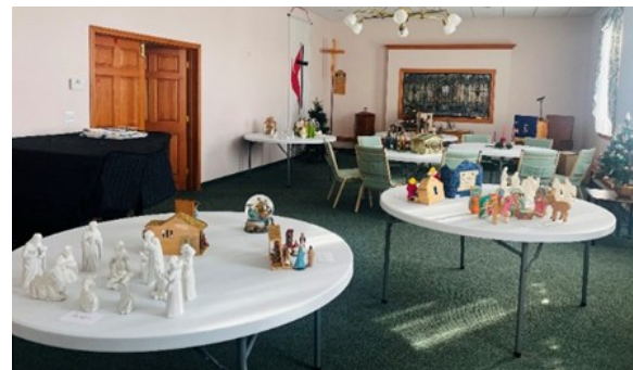
Left : Display of the Nativity Sets from the congregation