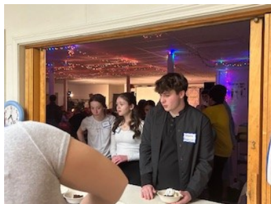
Behind the scenes— Youth picking up dessert, did it have cinnamon in it?