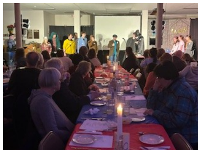
Watching with bated breath— Writing notes— in deep contemplation!