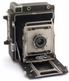
Photo intake Friday, April 24th from 6-8 pm

If you haven't started taking your photos there is still time! 9th Annual Rochester Community Amateur Photography Show