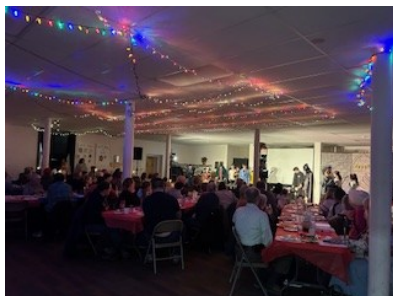
It's a MURDER MYSTERY Those in attendance— Who can you pick out?