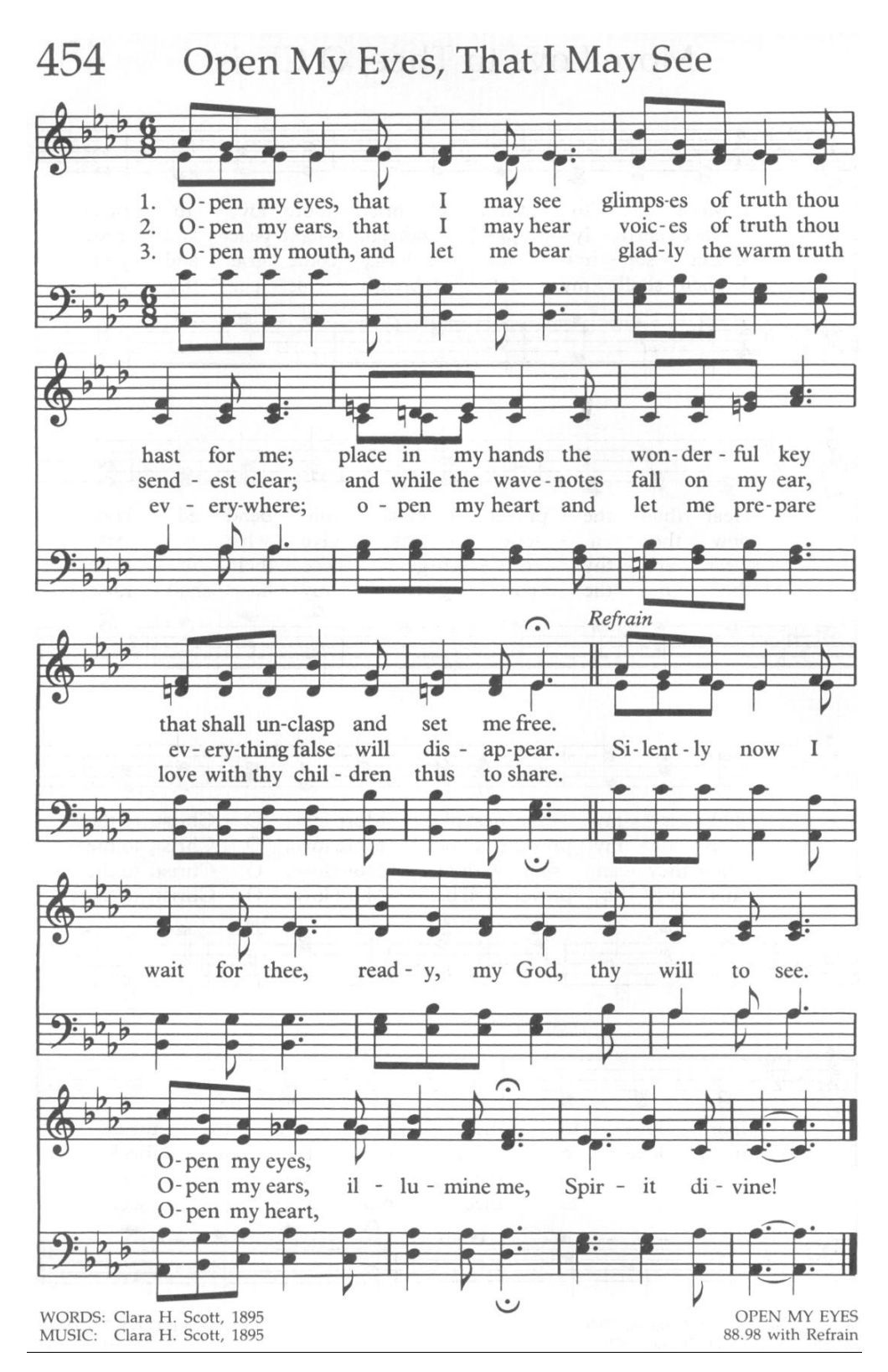
Words & Music: PUBLIC DOMAIN; permission to reproduce for worship bulletins is granted under the provisions of The United Methodist Hymnal and United Methodist Publishing House; PO Box 801, Nashville TN 37202